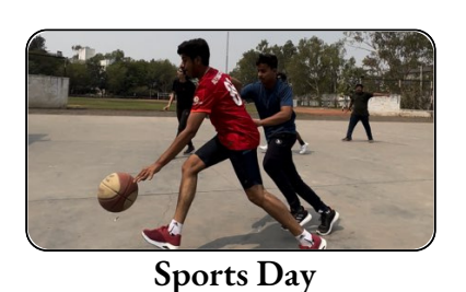
Learning beyond the classroom through the spirit of sports.